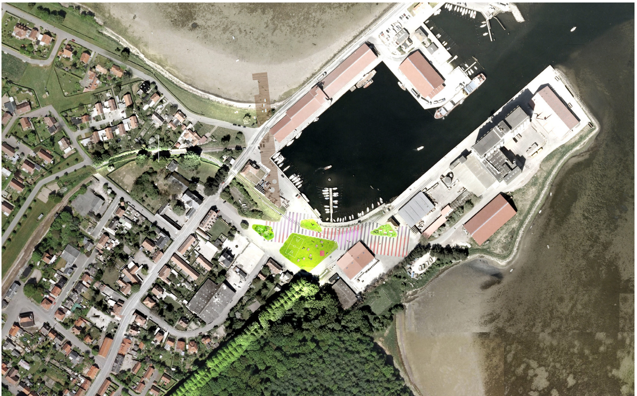
Square in Bandholm Waterfront

ADEPT in team with Schönherr landscape, Kuben Management and a team of consultants have won the planning competition “The Gate to Lolland”. The village communities surrounding Northern Europe’s biggest safari park, Knuthenborg, are to be strengthened and invite visitors to continue their journey in the scenic and cultural Island of Lolland.