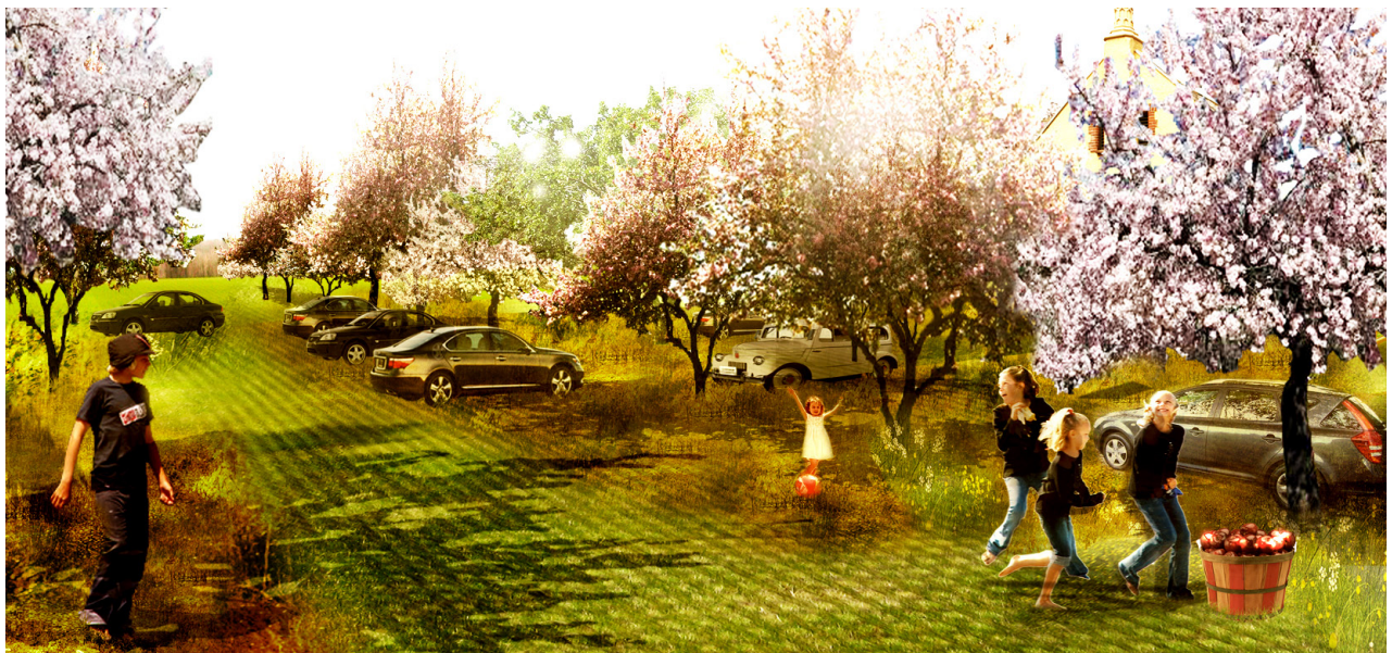
Parking-orchard in Hunseby-Maglemer