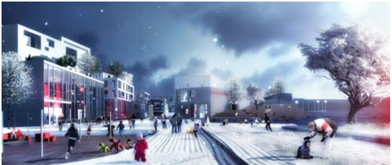
Activity plaza in Asker Centre's new loop

Asker Municipality in Norway continues its urban development towards a larger, more dynamic city centre. DARK (N), ADEPT (DK) and a consultant team have just won the international competition for city development and expansion of Asker Centre. Their project proposal “In the Loop” presents a unified, urban city for sports and social experiences.