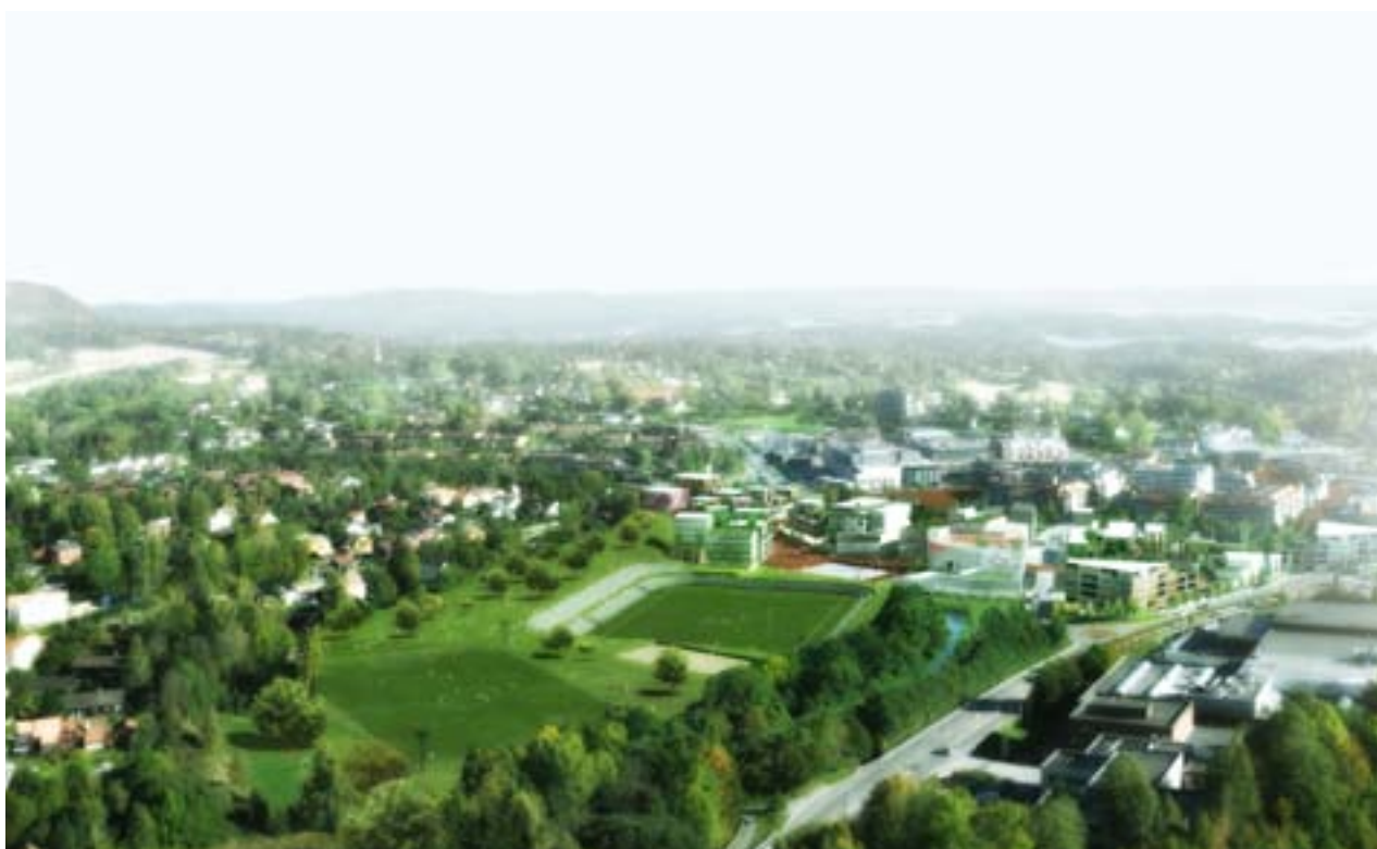
Image of the overall structure plan for Asker Sentrum