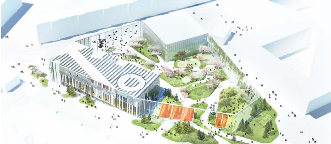
Caption image: MVRDV / ADEPT Architects, overview of House of Culture and Movement with park framed by the urban curtain. The volume on top is the commercial building on site, the lower right corner of the garden is reserved for House of Movement 2.

A full publication set with more images and diagrams is available at pr@mrvdv.nl or press@adeptarchitects.com