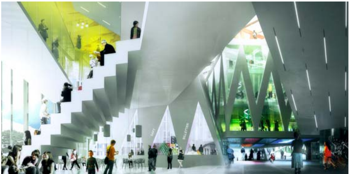
Caption image: MVRDV / ADEPT Architects, interior of House of Culture and Movement, Frederiksberg, Denmark.